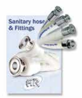
SILICONE HOSE & FITTINGS