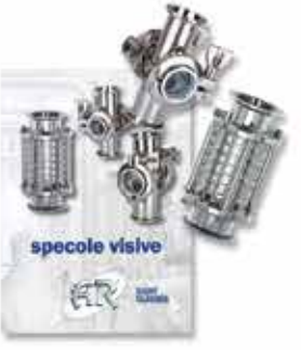
SIGH GLASS-FLOW INDICATOR